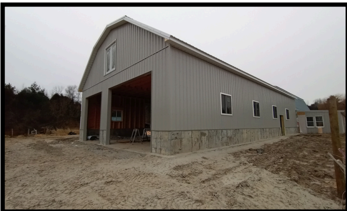
Covered Barnyard for Dairy Farm