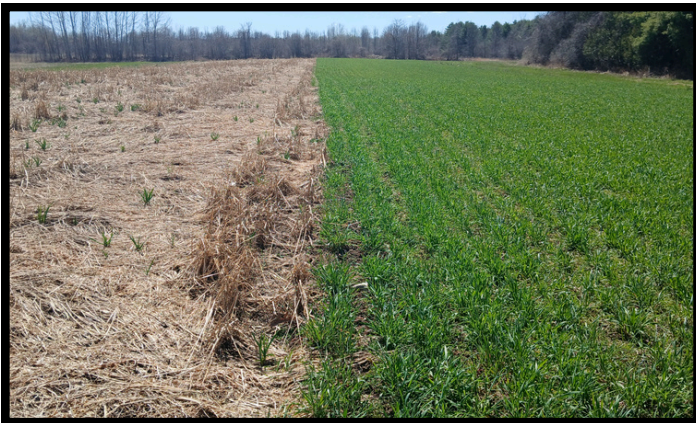
Over 2,500 acres of Fall cover crops were implemented across the county

Through the State AEM Round 18 and other funding sources, the District implemented projects to protect local water bodies, improve soil health, and increase farm viability. Below are some of the projects that have been completed.