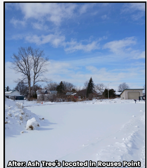
After: Ash Tree's located in Rouses Point