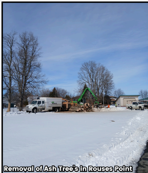
Removal of Ash Tree's in Rouses Point