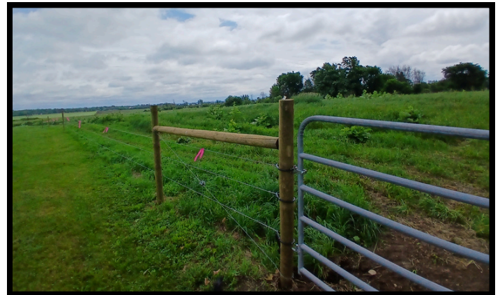
Fencing for Prescribed Rotational Grazing for beef herd