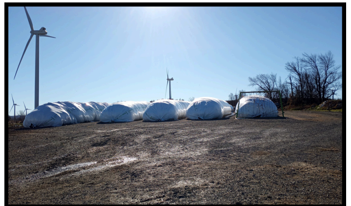
Erosion Control System for feed storage