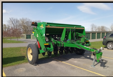
No-Till Drill $15.00/ acre + $30 Delivery fee