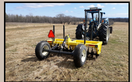
Aerway- Pasture Aerator Free for AEM Participating Farms