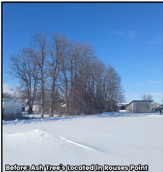
Before: Ash Tree's Located in Rouses Point

The District has identified eligible public areas, such as parks, for potential replanting sites and is working with all municipalities to replant new trees. These tree plantings will consist of native trees that will strengthen and diversify our urban forest population and will be implemented through 2026-2027. Town and village events to help volunteer with tree plantings will be announced once replanting sites have been approved by the appropriate personnel.