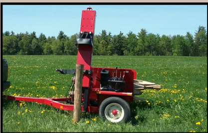
Wheatheart Post Pounder $25.00/ day $125.00/week

The District offers machinery to benefit conservation efforts in Clinton County. Below are some of our most popular machinery choices for agricultural use. For more information on renting a machine, please call us at (518) 561-4616 ext. 3.